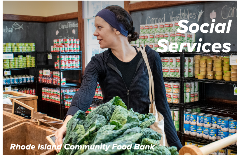
Rhode Island Community Food Bank