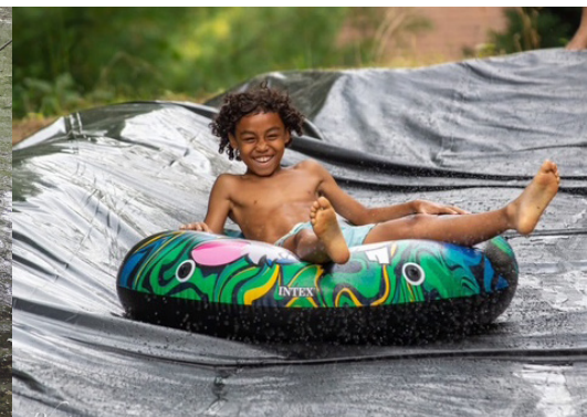
Mother of Hope Camp