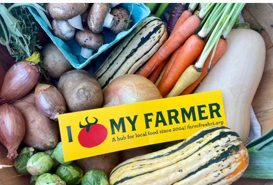
Farm Fresh RI