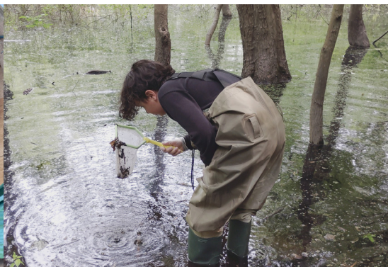
Providence After School Alliance