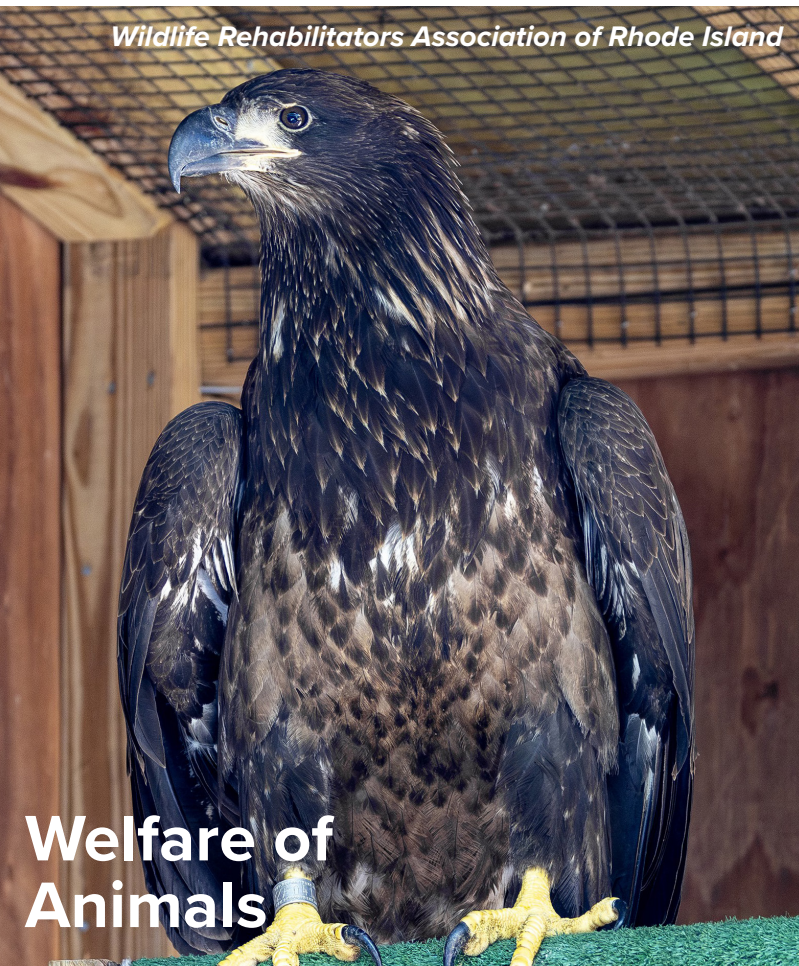
Wildlife Rehabilitators Association of Rhode Island