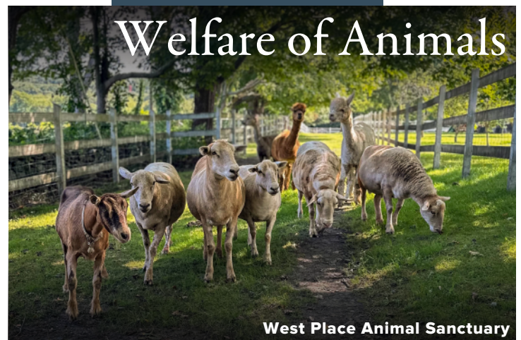
Welfare of Animals