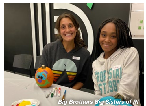
Big Brothers Big Sisters of RI