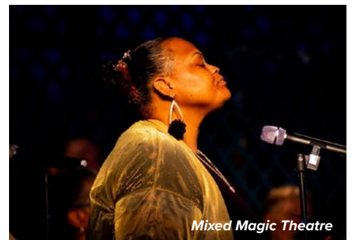
Mixed Magic Theatre