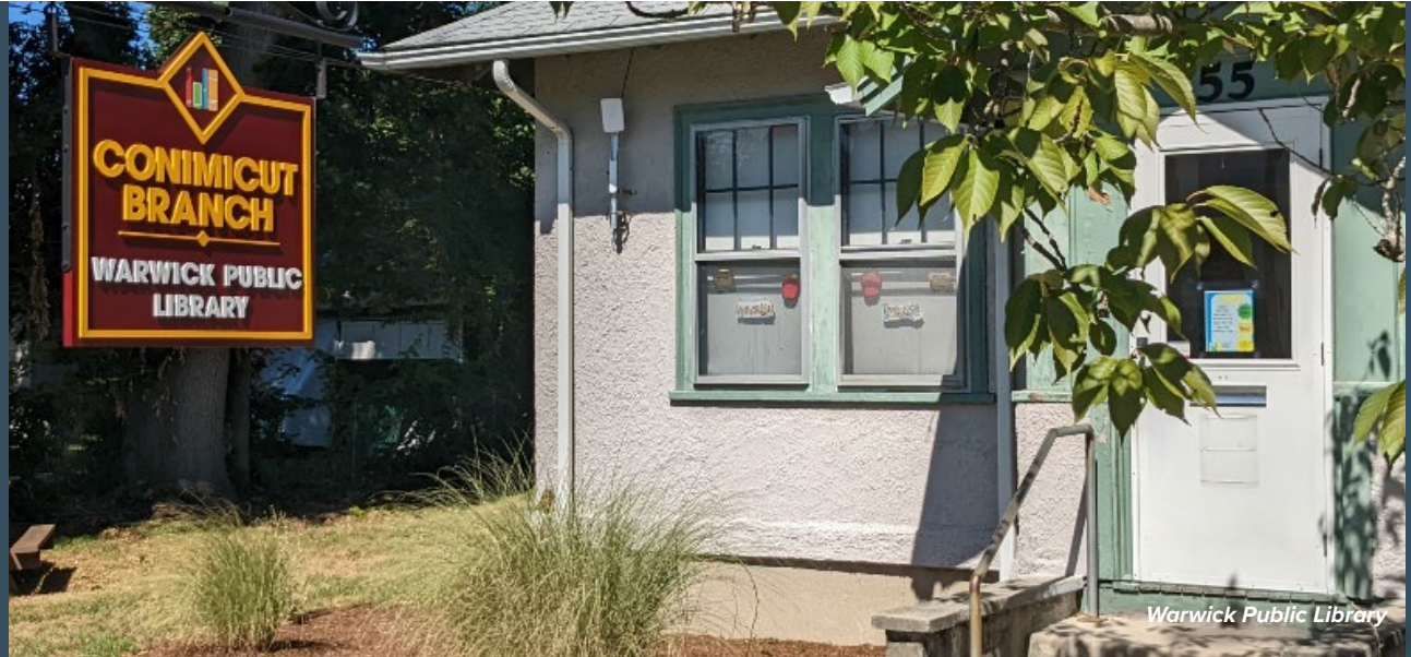
Warwick Public Library

Public libraries are another cornerstone of Champlin’s work and legacy of funding, with libraries in a dozen different communities supported in 2023.