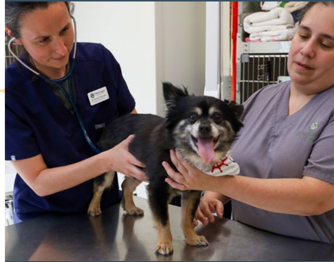
Potter League for Animals

The Rhode Island Society for the Prevention of Cruelty to Animals is well over a century old and has been receiving funding from the Foundation since 1972. The Providence Animal Rescue League tells a similar story, founded in 1913 and first receiving funding in 1978. The Potter League for Animals rounds out the list of grantees in this category this year and has been a force for good in Rhode Island since 1929.