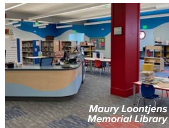
Maury Loontjens Memorial Library