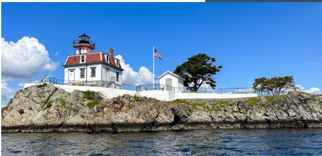
Friends of Pomham Rocks Lighthouse