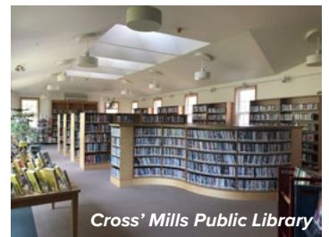
Cross' Mills Public Library