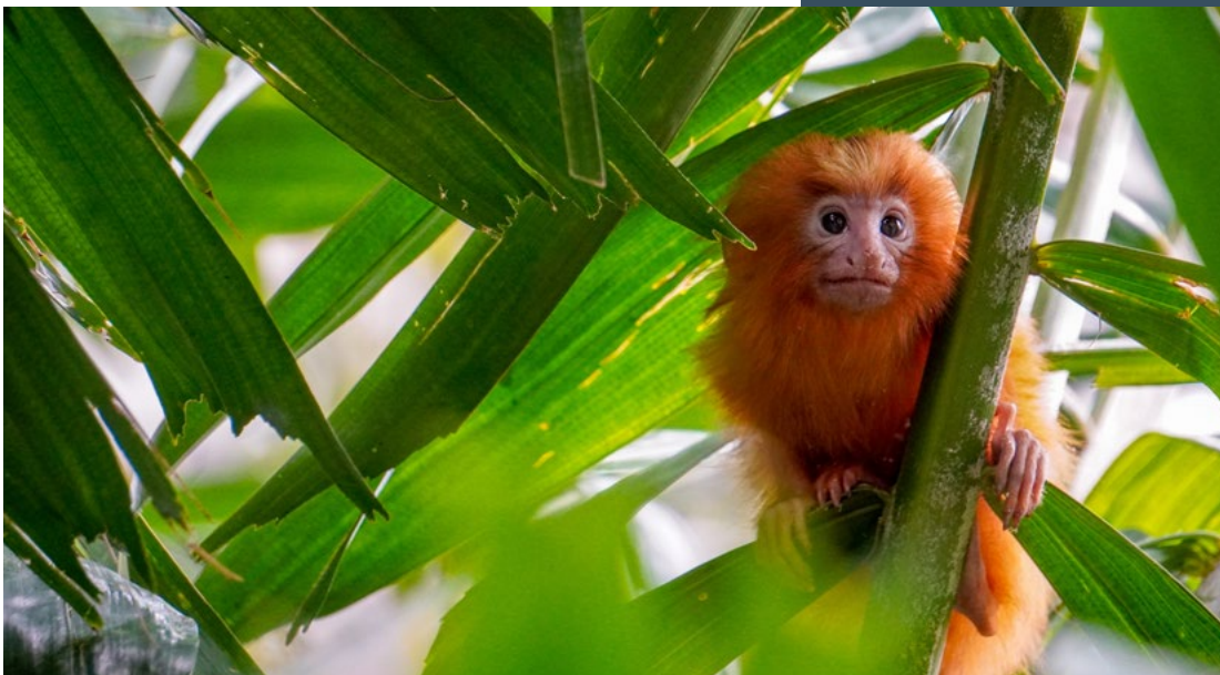
RI Zoological Society