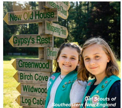
Girl Scouts of Southeastern New England

MENTOR Rhode Island has been engaged with the Foundation for over a decade, since 2012, in pursuit of its mission to ensure that youth have access to the motivational and supportive relationships they need to grow into confident, successful adults. South Providence-based Rhode Island Sports Union , providing youth leadership and development through athletics and physical activity, is a first-time grantee.