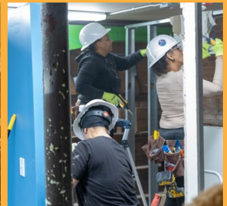
RI Women in the Trades