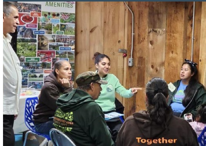
Woonasquatucket Riverside Watershed Council