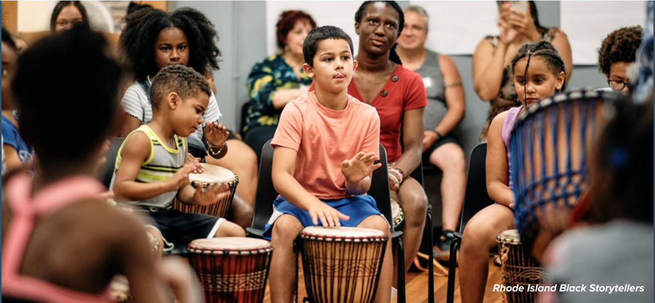
Rhode Island Black Storytellers

In 1973, Trinity Repertory Company moved to its present home, the iconic Lederer Theater at 201 Washington Street in downtown Providence. That was the first year The Champlin Foundation awarded funds to the theater. 50 years later, we are still investing in the theater, helping to enhance and expand the space, thereby advancing Trinity’s mission of reinventing the public square with dramatic art that stimulates, educates, and engages our diverse community in a continuing dialogue.