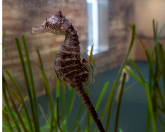
Save The Bay

Meanwhile, the Woonasquatucket River Watershed Council has been around since the 1990s but established a funding relationship with Champlin for the first time in 2023. The scope of the council’s work has greatly expanded throughout the watershed, sparking revitalization of low-income neighborhoods and restoring 75 acres of land to date.