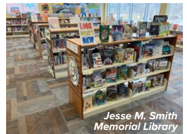
Jesse M. Smith Memorial Library