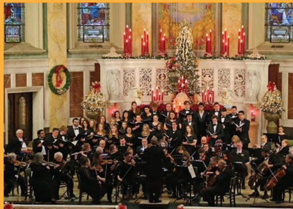
Ocean State Pops Orchestra