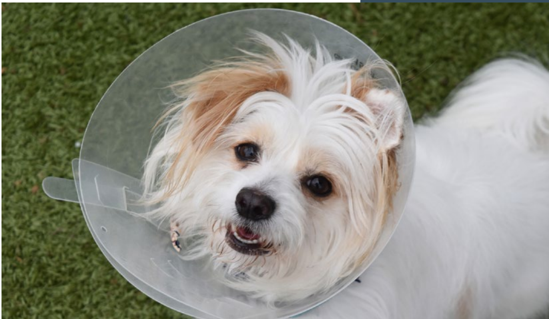
Providence Animal Rescue League