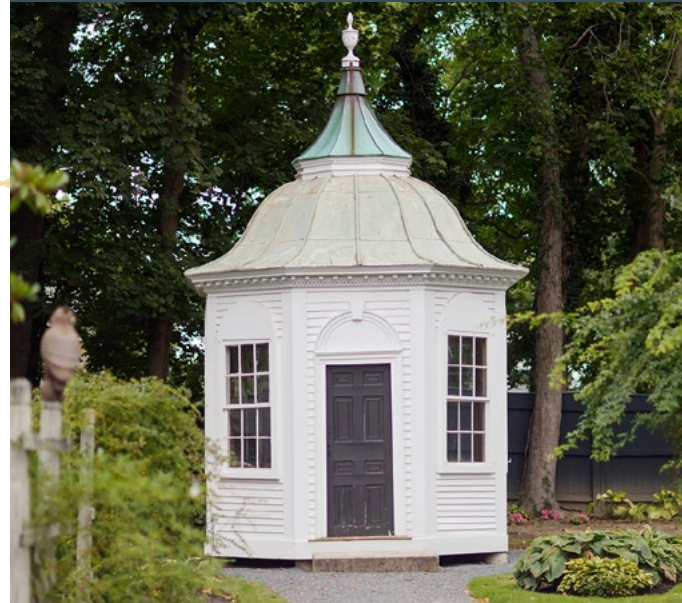
Friends of Linden Place

Smith's Castle is not alone among its peers in the Historic Preservation and Heritage area of focus, where grantees have a long and rich history in the Ocean State. Champlin has been funding historic houses of worship going back to the 1940s. St. James Episcopal Church in Woonsocket, for example, dates back to the early 19th century, and Haven United Methodist Church in East Providence to the later part of the century. Congregation Sarah Zedek has operated in Westerly continuously since 1917, but applied for and received its first grant from Champlin in 2023. Thanks to a variety of improvements, from painting and masonry to HVAC and accessibility upgrades, the 22 grantees in this category continue to bridge the gap between Rhode Island's past and what we can learn from it to inform our future.