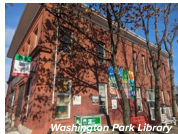
Washington Park Library

Maury Loontjens Memorial Library in Narragansett first received funding in 1981, but in 2023, the branch moved into its beautiful new home, providing a bright and modern space for library patrons. Similarly, in Warwick, the Warwick Public Library was first funded that same year—1981—yet its Conimicut Branch, a small building on Beach Avenue, is a new grantee this year.