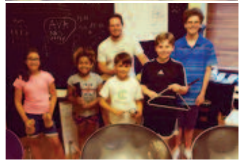
First time grantee Pawtucket based music organization Friends of the Rhody Center.