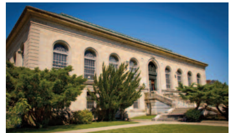
Knight Memorial Library, a neighborhood landmark to be restored.

A landmark building from another era, it is a hub for this urban neighborhood but years of neglect have caused the cost of necessary renovations to skyrocket. However, Providence Community Library (PCL), which operates all of the branch libraries in the city, has determined the time is at hand to begin this expensive process. Though this year's grant of $544,800 for exterior work is only a beginning, it is at least a start.