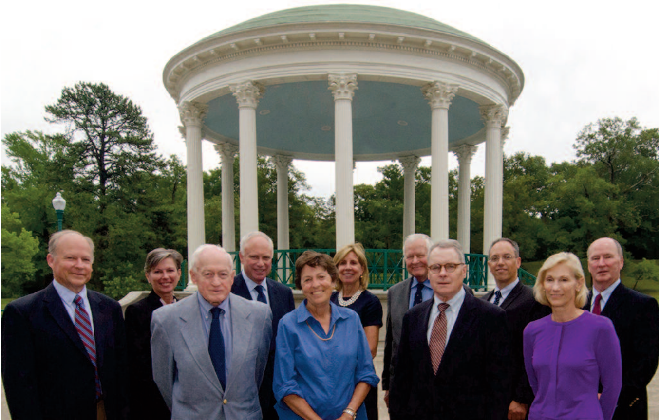
Members of the Champlin Foundation Distribution Committee photographed at the Roger Williams Park Bandstand