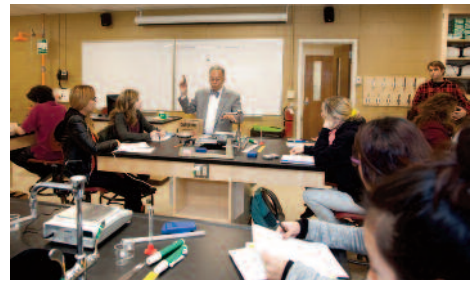
Rhode Island College's renovated Biology Teaching Laboratory funded through a 2015 grant.

Continuing the theme of workforce development, support continues for past grantees New England Tech ($120,945) and the Rhode Island Construction Training Academy ($55,530) but also includes a first time grantee Hope & Main ($25,215) a food related incubator located in Warren.