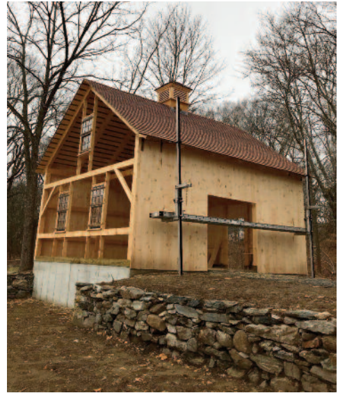
Funded through a 2016 grant, construction of a replica barn at the historic Kelly House in Lincoln within the new Blackstone Valley National Historic Park is well underway.

In addition, a first time grant to the Hope Valley Grange and Community Center ($100,000) will provide funding to open up the riverfront providing greater access along the Wood River and to create a small park area on land behind the community center and adjacent to youth playing fields for the public’s enjoyment.