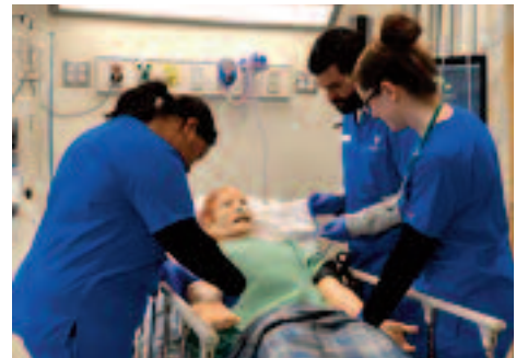
Nursing students work with a simulated manikin funded through a 2016 grant.