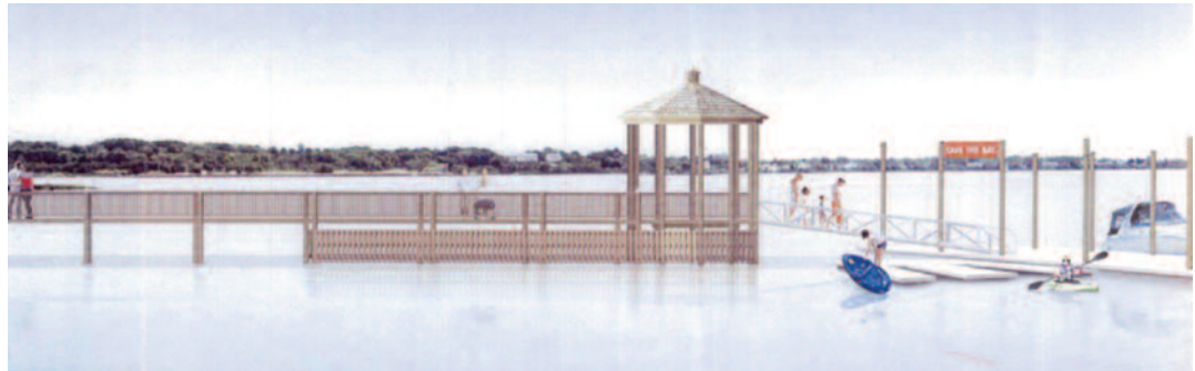
A 2017 grant to Save The Bay will construct a public pier at Field’s Point in Providence for fishing and kayaking.