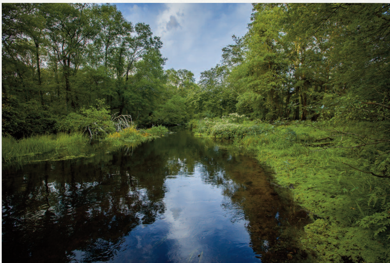
Pawcatuck River.

A 2016 grant to The Nature Conservancy funded the construction of a parking lot and canoe and kayak launch which provides safe public access to this beautiful stretch of the Pawcatuck River.