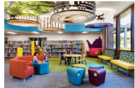
Completed new children's area at Cranston Public Library funded through a 2014 grant.