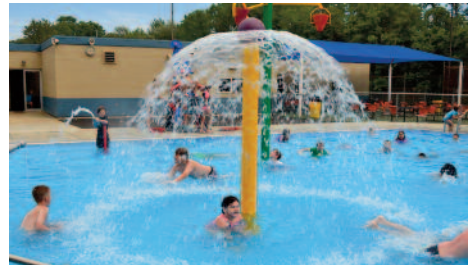
Blackstone Valley Boys & Girls Club completed pool project funded through grants provided in 2014 and 2016.