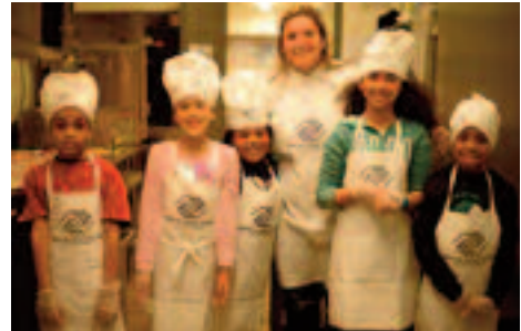
Boys & Girls Clubs of Providence features a newly renovated kitchen area at the Fox Point facility funded through a 2015 grant.

Also within this category, our campership program, now in its 27th year, provided $400,000 sending thousands of Rhode Island kids to summer camps operated by twenty-four different organizations.